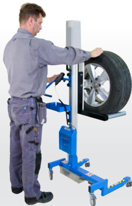
Lift trolley for tyre