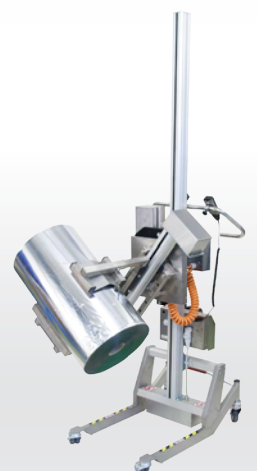
Lift trolley with Squeeze&Turn (stainless)