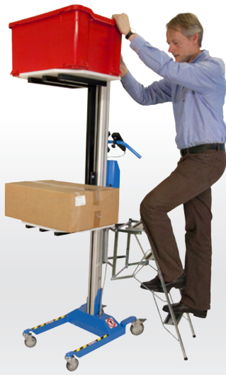
Lift trolley for archives