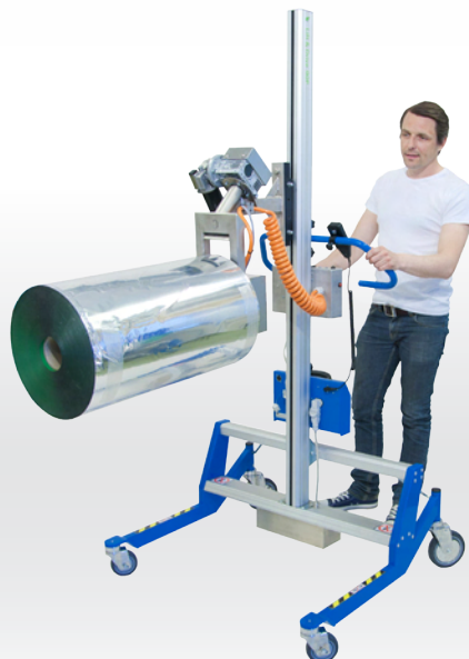
Lift trolley with Expand&Turn