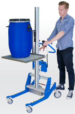
Lift trolley with roll platform