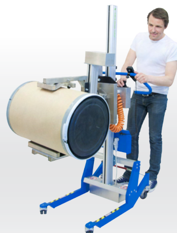
Lift trolley with Squeeze&Turn