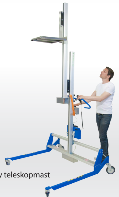
Lift trolley teleskopmast