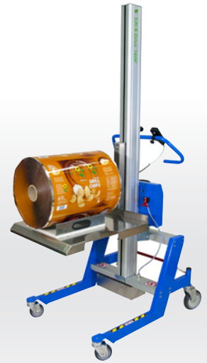
Lift trolley for roll handling