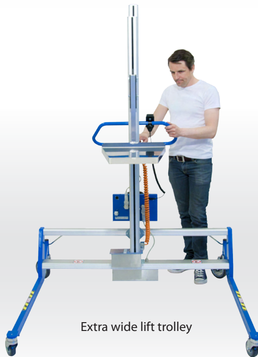
Extra wide lift trolley